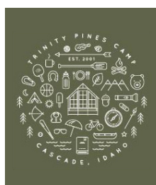
LONG SLEEVE TEE