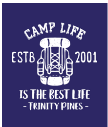
SHORT SLEEVE TEE

NEW IN THE CAMP STORE: Campers will have a chance to purchase one of the new shirts below. We have lots of other fun camp souvenirs for you!