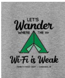
SHORT SLEEVE TEE